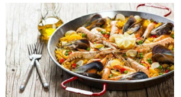
Silent Auction Item 2 Paella making experience in Barcelona for 4