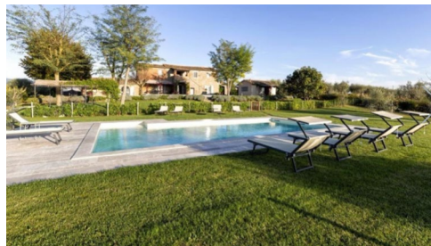
Silent Auction Item 1 Tuscan villa with private chef for 10 (7 nights)

Enhanced Revenue: Items sold via sealed bidding raise 11% more than those sold through standard incremental bidding.